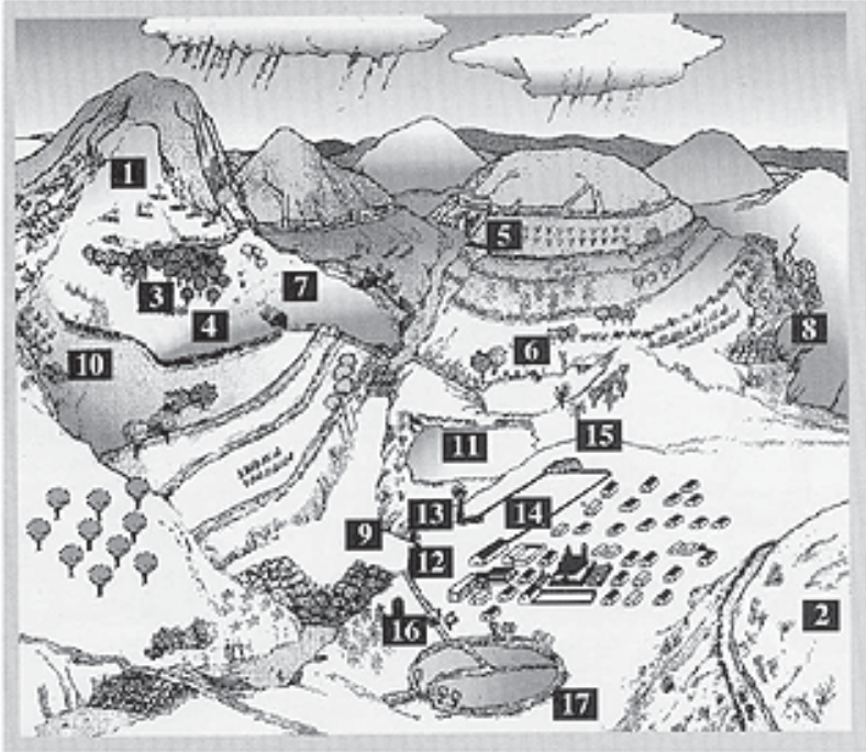
Figure 2. Harvesting water through watershed regeneration in the Mixteca region, Mexico

To regenerate the Mixteca region's basins, specific treatments are applied on the hills, knolls, valleys and ravines using different technologies. The work begins on the hills with retaining devices that include ditches and trenches (1), water harvesting ring (2), reforestation (3) and contour lines with vegetation (4). On the rises where the slopes are less steep than on the hills, borders, terraces (5), earthen dikes (17) and watering holes (6) can be built, making it possible to water cattle and other animals or irrigate crops. If we take into account that ravines have been formed where water has most easily eroded the soil, it can be regenerated by building rock seeping dams (7) or gabion